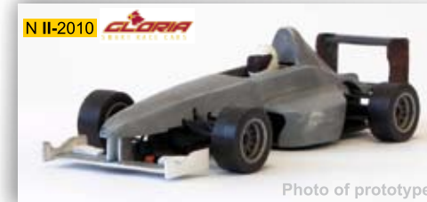
Photo of prototype

Czechia team - FormulaStar - drivers TBA Motraxx Motor, 2x adjustable FeNdB magnets FaroRacingComponents - front and rear wing