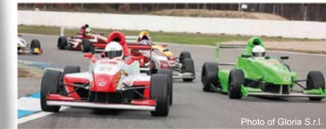
Photo of Gloria S.r.l.