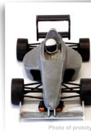
Photo of prototype