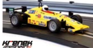
FARO 1/32 scale first models: Czech National Formula (NF 1400), Team Krenek Motorsport, FIKS 01, ABS car body.