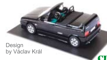
Design by Václav Král

100% hand made SRC in big scale. ABS + resin cast car body, FARO chassis (Favorit SRC) Motor Super, FeNdB magnet Colours: red, dark blue, white silver, black. Thermotransfer decals. 20 cars monthly only.